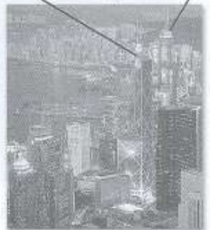
Bank of China Tower Central Plaza