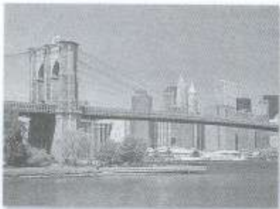
The Brooklyn Bridge, New York City