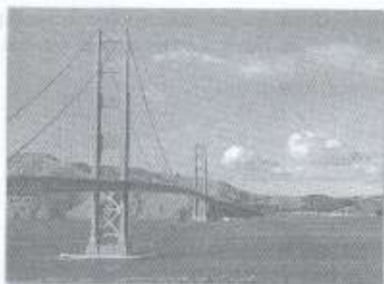
The Golden Gate Bridge, San Francisco