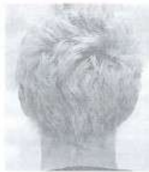
wavy blond hair