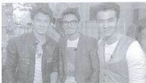
The Jonas Brothers, singers and musicians

A: What's he like? B: He's a confident and creative actor.