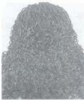
long black hair