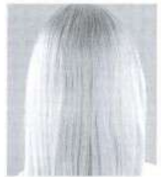
straight blond hair