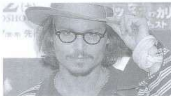
Johnny Depp, actor