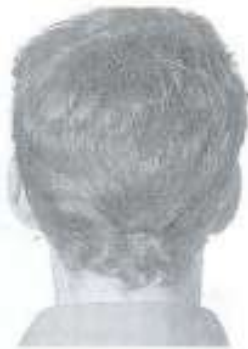
short brown hair