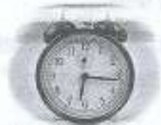
an alarm clock

Jenny: That's nice. I never wake up early without an alarm.