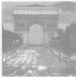
6. Arc de Triomphe _____