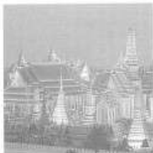
1. Grand Palace