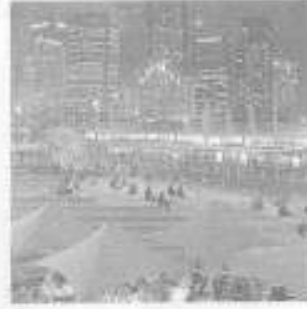
8. Federation _____

2 Complete the sentences. Write three of the places from Exercise 1.