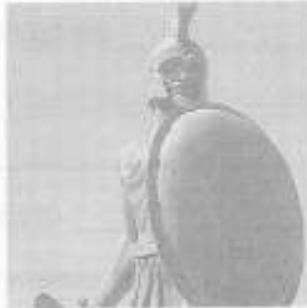
3. _____ of King Leonidas of Sparta