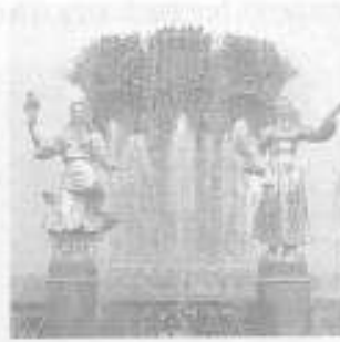
7. Friendship of the Peoples _____