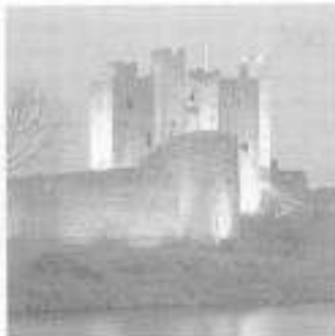
2. Trim _____