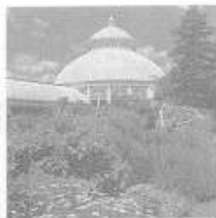
5. New York _____