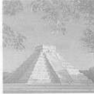
4. Chichen Itza Mayan _____